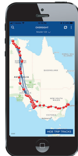
Oversight Mobile - Map Detail